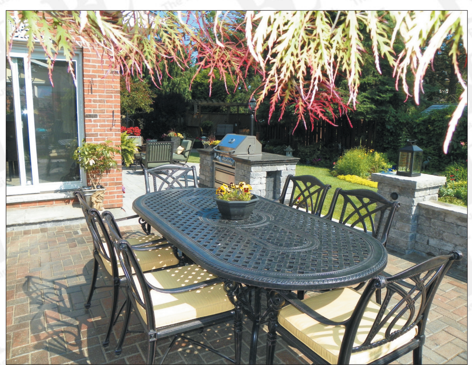
A place to entertain. This patio area includes stone wall accents and a built-in BBQ.

At Tree Amigos Landscaping, the average job can take anywhere from a couple of days to several weeks depending on the complexity of work involved. (During each assignment, their team always make it a point of keeping their customer's property clean and secure until the work has been completed.) Once the job is finished, their team reviews the work with the customer and provides them with a number of care tips so they can maintain their property for years to come.